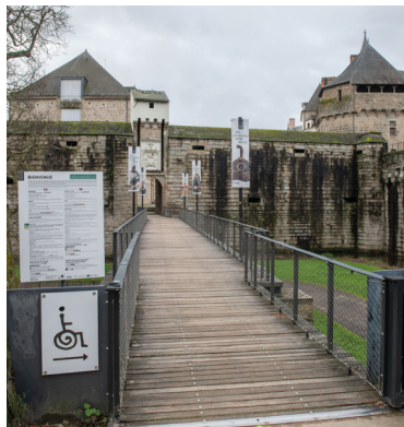
4 - Access to Château