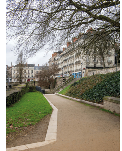
3 - Access to Château at back of the garden