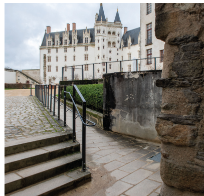
5 - Access to the courtyard (ramp to the right of the porch)