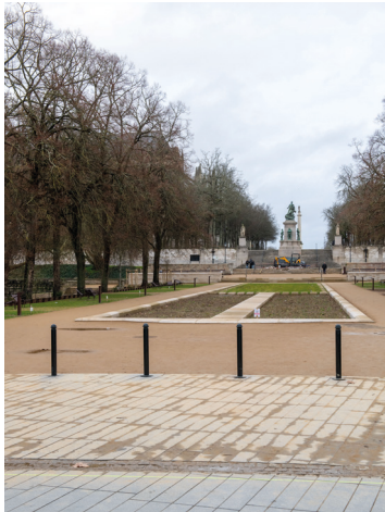
1 - Entrance to Jardin Duchesse Anne garden

The moat gardens are wheelchair accessible. Accessible entrance is located near the “Duchesse Anne” tramway stop