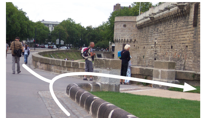
6 - Access to the moat gardens