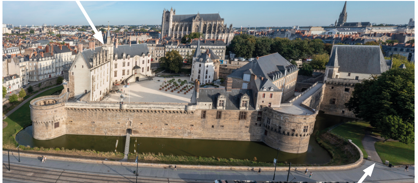
Access to moat gardens